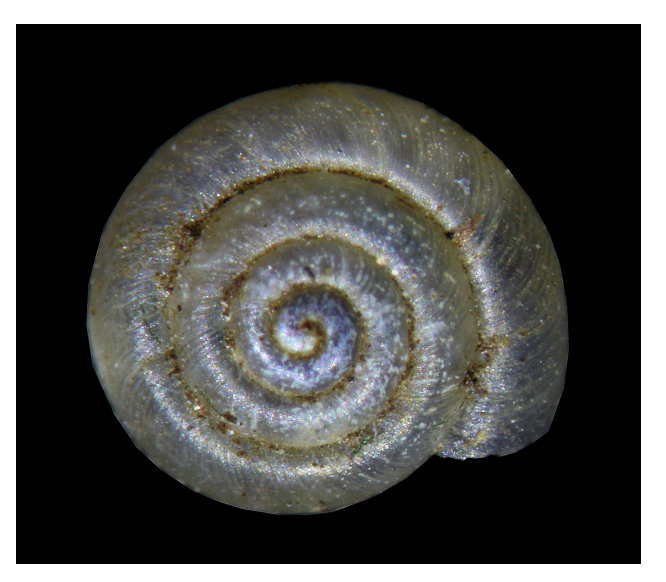
Fig. 2. Shell of Hawaiia minuscula (Binney, 1841), diameter 2.21 mm, from the greenhouse of the Botanical garden of the Comenius University in Bratislava

In addition to H. minuscula, six other alien species exclusively occurring in greenhouses (Table 1) and more than 40 predominantly native species with outdoor occurrence (Table 2) were recorded in the greenhouses under survey. In case of Gulella io, the species recorded by FLASAR & KROUPOVÁ (1976a, b) only, we were not able to confirm its occurrence, as the greenhouses no longer exist. Another species found by FLASAR & KROUPOVÁ (1976a), Opeas hannense, was not confirmed either, despite the efforts made during the survey in 2003 and repeated in 2013. The most common alien greenhouse snails were Z. arboreus and L. valentiana. Z. arboreus is thus far only known from greenhouses in Slovakia, although several outdoor populations have already been found in the Czech Republic, Germany, Hungary and Sweden (DVOŘÁK & KUPKA 2007). A new record of Deroceras invadens was made in greenhouses of the Botanical Garden in Košice (locality No. 5). Thus, the species still remains unknown outdoors in Slovakia. HORSÁK & DVOŘÁK (2003) expected it to be more commonly distributed in the cultural landscape of the Czech